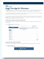
Angel Tree App For Volunteers