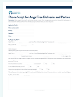
Call/Text Script Document