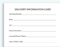
Delivery Information Card