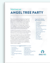
Hosting a Party Guide