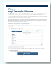
Angel Tree App For Volunteers