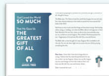
Gospel Presentation Card