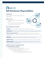
Gift Distribution Responsibilities