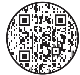
Angel Tree Promotional Video

You can find this video in the Resource Library. For best viewing experience, we recommend downloading ahead of time rather than streaming it.