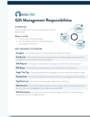
Gift Management Responsibilities