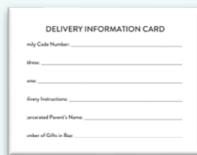
Delivery Information card