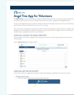
Angel Tree App for volunteers