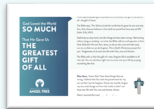
Gospel Presentation card